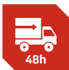
Parts Delivery 48h

SEE WHAT ARE CAN DO FOR YOU – CALL US AND GET TO KNOW IT IN ACTION!